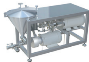
BLENDING/MIXING PROCESS UNIT

At the heart of all good beers and seltzers is a proven recipe and the use of quality ingredients. Following close behind is the build out of a reliable production system that allows you to achieve process consistency at increasing volumes. That's where Statco-DSI's beverage processing solutions come in. They offer everything from complete systems in cold processing to modular process units like mixers and blenders. Their technologies deliver accurate mass transfer ratio when injecting carbonation or nitrogenation. They also add the flavors and ingredients such as hops, controlling for even distribution and dissolution. Additionally, Statco-DSI offers a unique system for craft brewers known as the Hopsys that supports dry hopping. It incorporates the unique process of introducing the hop pellet directly into the beer stream under the liquid level, which helps assure consistent wetting and minimal dissolved oxygen pickup—resulting in an overall better end-product for your customers.