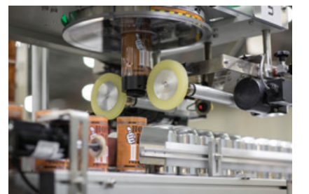
SHRINK SLEEVE APPLICATOR

Craft beer production can vary from smaller seasonal to high quantity, and with this comes the need for an economical solution for labeling different can quantities. Axon's shrink sleeve applicators provide a simple, flexible alternative to directly printing on cans. It doesn't matter if you are just starting out or looking to expand your production, Axon has a shrink sleeve applicator that's right for you.