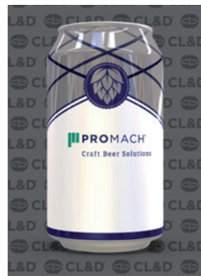
SHRINK SLEEVE PRODUCTION

Interfeit technology, color-shifting inks, and tactile coatings. CL&D Shrink films offer many versions of PET, PVC, OPS, and White Blackout. Additional advantages of using CL&D include: research and development support, reduced inventories, bundle packs and perforations/easy-tear, and fast lead times.