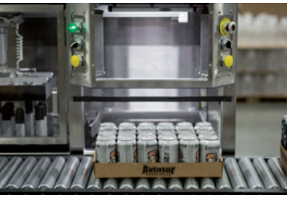
CASE/BOX FORMING & SEALING

It's time to pack some beer for your outgoing orders. Depending on if the beer is in bottles or cans, it will need to be packed in cases or trays. However, those cases and trays are likely purchased as a stack of flat cardboard that still needs to be formed. Wexxar Bel offers solutions that help with just that. For the craft brewers that are expanding into further distribution opportunities but wanting to minimize the accompanying manual labor time, Wexxar Bel provides semi-automatic and fully automatic, case/tray formers and sealers. These machines accommodate a range of production volumes from low to high-speed, all built to make the bottle or can bundling process easier and faster.