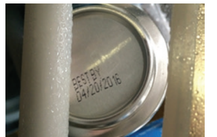
DATE AND BATCH CODING

Achieve high quality codes – every time – with ease of use and minimal maintenance intervention. ID Technology's Citronix continuous inkjet (CIJ) printers are the ideal solution for adding date codes to your bottles and cans. All Citronix CIJ printers feature IP55 washdown protection as standard and are built to perform in harsh environments. An alternative to printers and managing the consumable materials that go along with it, is the iCON Masca laser. Specifically designed for small character coding applications, this laser has a very competitive price point for the budget conscious brewer.