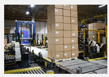
STACKED PALLETS DISCHARGE FROM EACH BOX BOT CELL BUILD STATION ONTO A CENTRALIZED TRUNK LINE THAT CONVEYS TO AN AUTOMATIC STRETCH WRAPPER.