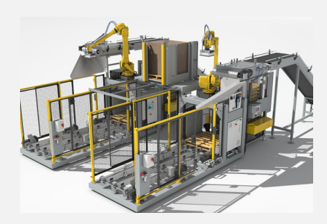
16 SKID-BASED BOX BOT SERIES PALLETIZERS WITH 6-AXIS ROBOTS ALLOW FOR ROBOTIC PLACEMENT OF PALLETS AND SLIP-SHEETS WITHOUT THE NEED FOR ADDITIONAL FUNCTIONALITY ON THE ROBOT'S EOAT.